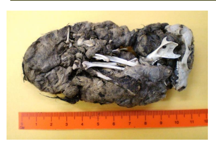
Figure 3. An example of a masked owl pellet.