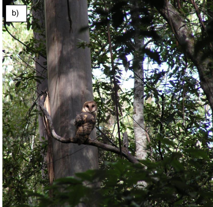
Figure 2. a) An example of a masked owl nest tree and (b) roost site.