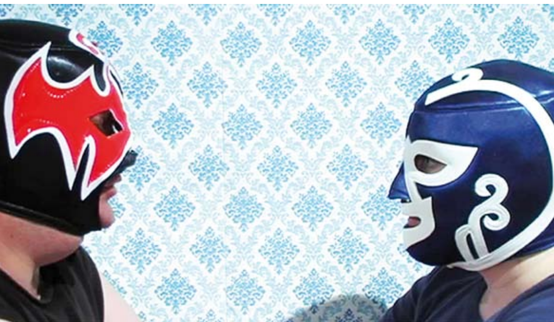
Mascara Contra Cabellera 1 ('Superheroes'), 2008 Sally Rees INFLIGHT Gallery