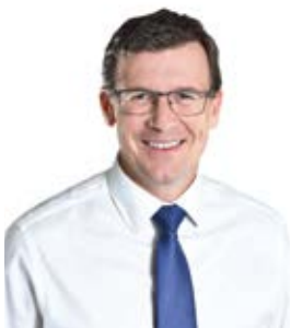
The Hon Alan Tudge MP Minister for Population, Cities and Urban Infrastructure

The COVID-19 pandemic has had major impact on the community and economy of Launceston, Australia more broadly and the rest of the world. At the same time it presents opportunities that we can leverage to boost Launceston's reputation as the most liveable and innovative regional city.