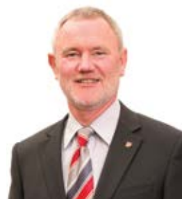
Mayor Albert van Zetten City of Launceston