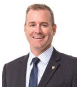
The Hon. Michael Ferguson MP Minister for Infrastructure and Transport Minister for State Growth